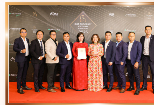
Best Real Estate Developer in Southern Vietnam 2025 Dot Property Vietnam Awards