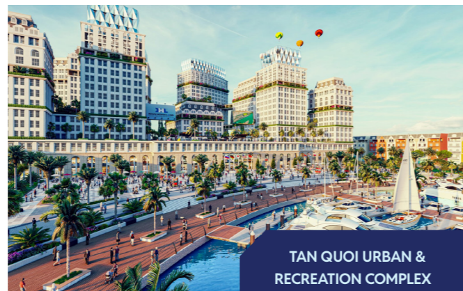
TAN QUOI URBAN & RECREATION COMPLEX