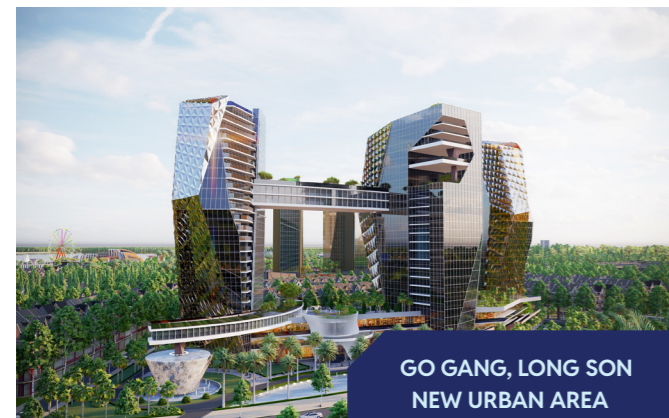
GO GANG, LONG SON NEW URBAN AREA