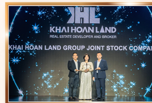
Best Workplace in Asia 2025 HR Asia Awards