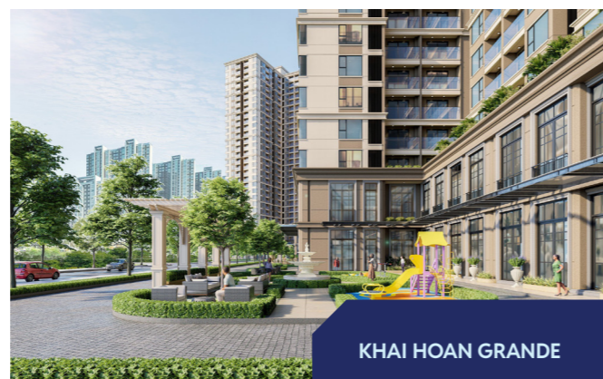
KHAI HOAN GRANDE