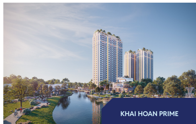
KHAI HOAN PRIME