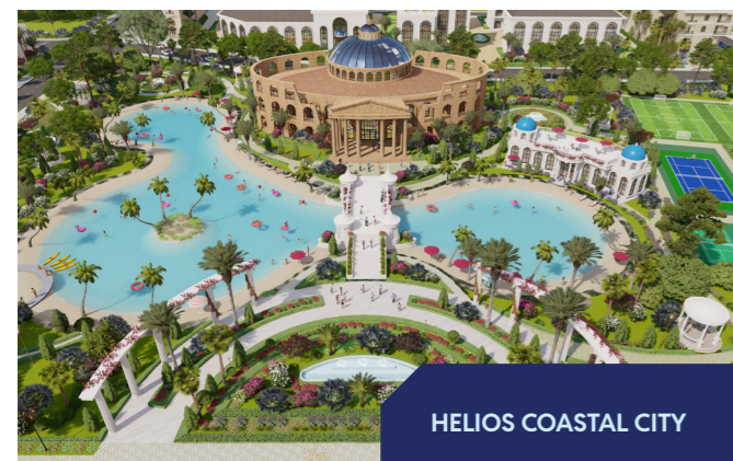
HELIOS COASTAL CITY