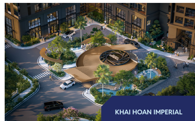
KHAI HOAN IMPERIAL